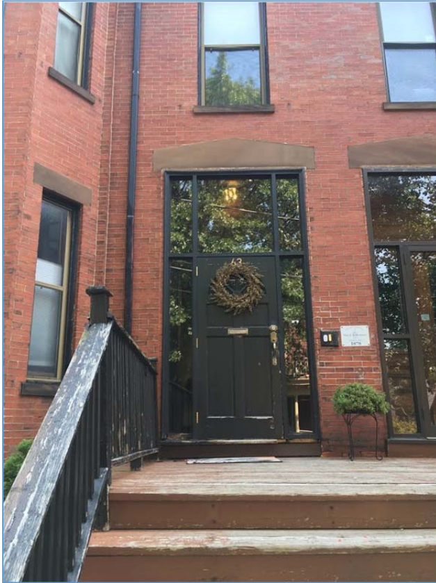
63 Adams Street - Existing Door