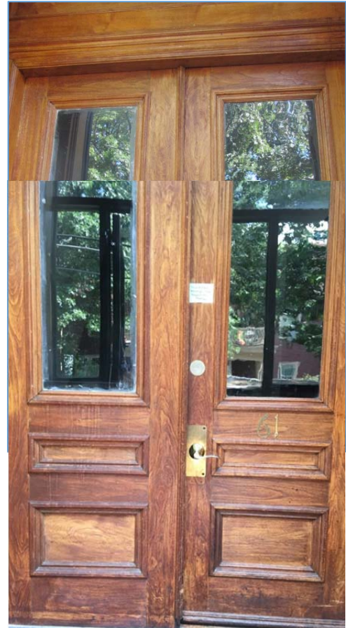
61 Adams Street - Existing interior door which had been enclosed by the outer doors.